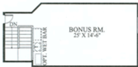
3RD LEVEL FLOOR PLAN