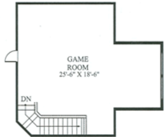
SECOND LEVEL FLOOR PLAN