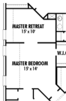
OPT. MASTER RETREAT